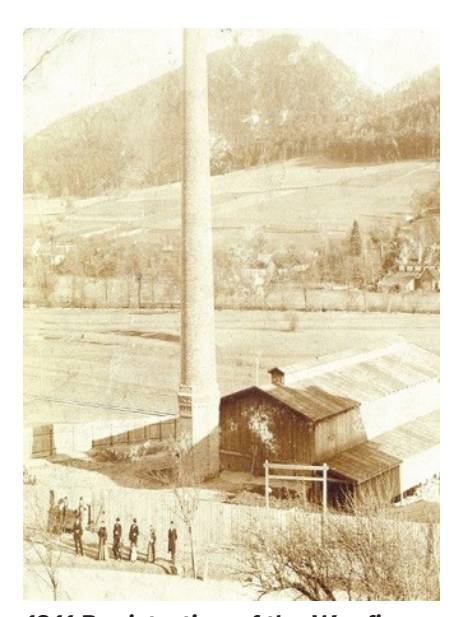
1911 Registration of the Wopfin Stone and Lime Works in the Commercial register. At that time there were two lime kilns and an office building.