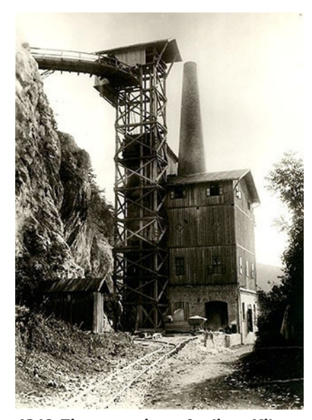
1810 First mention of a lime Kiln on the main road to Gutenstein, Austria.

In 1988 the creation of the Baumit brand was sealed by means of a collaboration between two Austrian building materials companies.