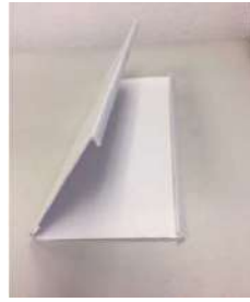
N4500113-UNIT (65) N4500112-UNIT (100)