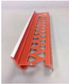
N4500151-UNIT SF - SILL FLASHING 3.0