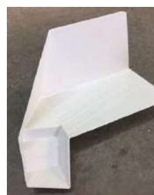
N4500140-UNIT (L) N4500141-UNIT (R)