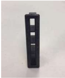
N4500122-UNIT CC - CAVITY CLOSER 20MM 2.7