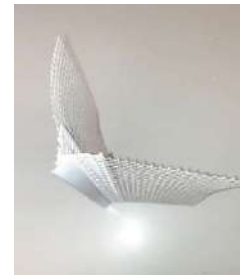
N4500117-UNIT DEB - DRIP EDGE BEAD 2.5