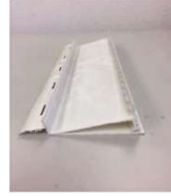
N4500156-UNIT LUC75 - THERMASHELL LIPPED U CHANNEL