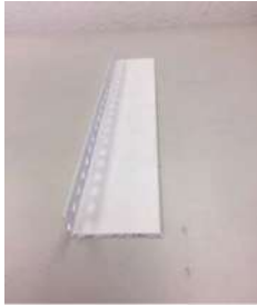
N4500142-UNIT LB - LIPPED BEAD 50MM 2.7