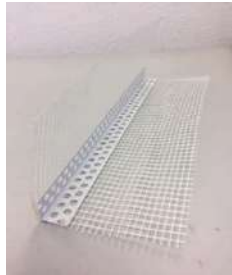
N4500146-UNIT PMC - PREMESH CORNER 2.5