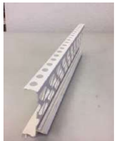
N4500154-UNIT TJF - THERMASHELL JAMB FLASHING