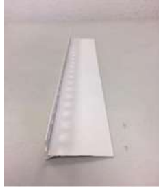
N4500143-UNIT LLB - LIPPED L BEAD 50MM 2.7