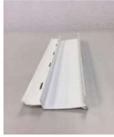
N4500144-UNIT LUC - LIPPED U CHANNEL 50MM 2.7