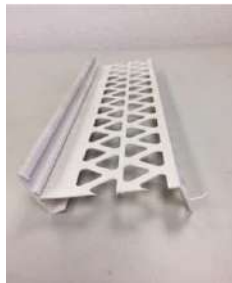
N4500155-UNIT TSF - THERMASHELL SILL FLASHING