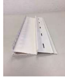
N4500145-UNIT LUC40 - LIPPED U CHANNEL 40MM CAVITY