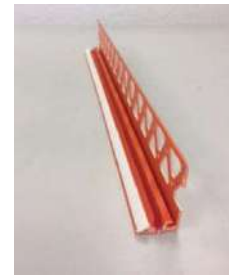
N4500152-UNIT SJF - STICKY JAMB FLASHING 2.7